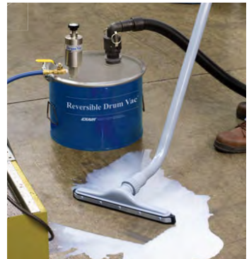
Model 6901 Spill Recovery Kit used with the Mini Reversible Drum Vac provides fast cleanup of messy spills.