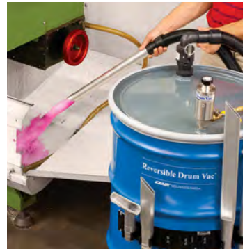
Premium Reversible Drum Vac provides on board tools and versatility for liquid cleanup and handling around the shop.