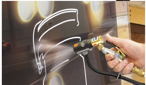
The Model 8293 Gen4 Ion Air Gun cleaning artwork and glass prior to framing.

The Gen4 Ion Air Gun is quiet, lightweight and features a hanger hook for easy storage. The 10 foot (3m) armored and electromagnetic shielded power cable is extremely flexible, designed for rugged industrial use.