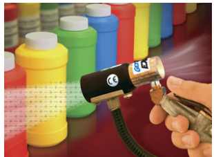
The Model 8293 Gen4 Ion Air Gun neutralizes and cleans plastic bottles prior to labeling.