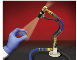
The Model 8194-9362 Gen4 Stay Set Ion Air Jet Kit cleans dust from a glass lens prior to installation on a gauge.

The Gen4 Stay Set Ion Air Jet comes complete with a magnetic base that allows easy mounting and portability on a machine, a bench or other surface. A shutoff valve on the base provides infinite control of the force and flow. For hands free operation, an optional Model 9040 Foot Pedal (requires floor or machine mounting) is available.