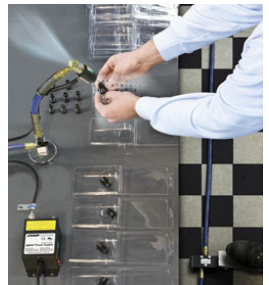
The Gen4 Model 8910 Instant Static Elimination Station removes contaminants on plastic fittings prior to packaging.