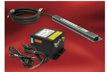
Model 8006 6" (152mm) Gen4 Ionizing Bar and Model 7960 Gen4 Power Supply.

Special length Gen4 Ionizing Bars up to 119" (3.02m) are available. Please contact our factory.