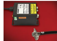
The Model 8299 Gen4 Ionizing Point System includes the Gen4 Ionizing Point and Model 7960 Gen4 Power Supply.

Maximum Ambient Temperature: 165°F (74°C)