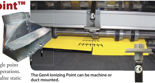
The Gen4 ionizing Point can be machine or duct mounted.