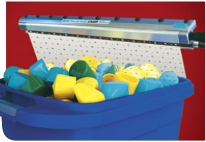
The Model 8218 18" (457mm) Gen4 Standard Ion Air Knife System showers parts with static eliminating ions to prevent personnel shocks.

Compressed air inlets are provided on each end of the Gen4 Standard Ion Air Knife. For long spans, multiple Gen4 Standard Ion Air Knives can be mounted end-to-end. This produces an air gap at the connection end of about 2" (51mm). (If no air gap is desired, use the Gen4 Super Ion Air Knife.) Special length Gen4 Ionizing Bars up to 119" (3.02m) are available for multiple air knife applications.