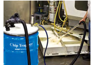
The Chip Trapper pumps the coolant back into the sump - free of chips and debris.