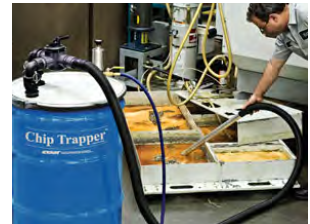
Chips can accumulate in the sump, restricting coolant flow.

A sudden lack of coolant flow in a machining operation will likely damage the part and expensive tooling. Machine tools commonly discharge some chips and shavings into the coolant sump. As the chips accumulate and mound up, the coolant flow used to flood the part and tooling becomes restricted. Some high pressure coolant systems sound an audible alarm and abruptly shut down the machine when low coolant flow occurs. This results in downtime to fix the problem and clear the alarm. That isn't the case with standard machines where immediate damage can occur if the operator fails to spot the lack of coolant. Regular cleaning of the coolant sump with the Chip Trapper can quickly eliminate this very costly problem.