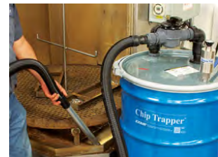
Chip Trapper filters out solids from parts washer fluids.