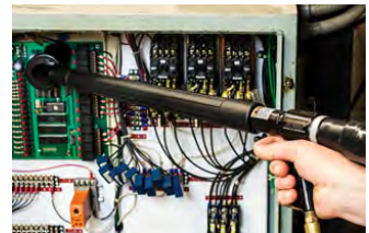
Model 6292 Vac-u-Gun Transfer System carries dust away from sensitive electronic controls.