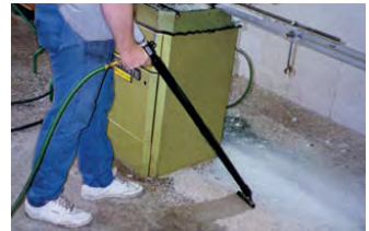
Model 6192 Vac-u-Gun Collection System with bag vacuums absorbent and chips.