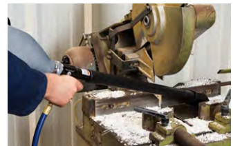
Model 6392 Vac-u-Gun All Purpose System removes plastic shavings from a saw.